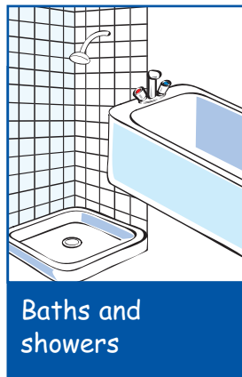
Baths and showers

4 Once surface is dry, remove safety signs.