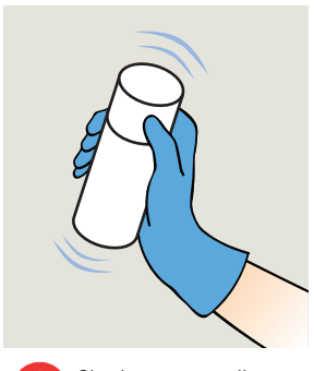
2 Shake can well before use.