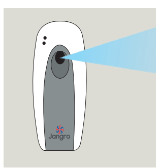
Close dispenser and press options to preferred seconds of bursts.