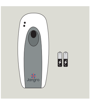
Place batteries into dispenser. Ensure the unit is switched off when replacing bateries or gerosols.