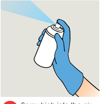
3 Spray high into the air, into 2 second bursts.