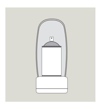
Open dispenser by pressing the button located on top of the unit. Remove the lid from the spray can and place inside the dispenser.