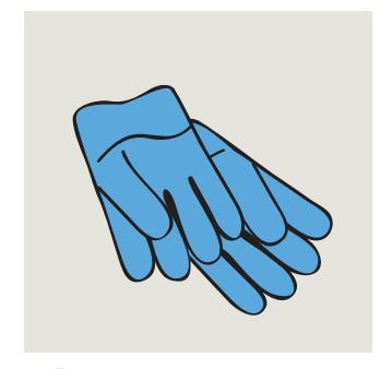
Use appropriate PPE as indicated in COSHH data sheet.